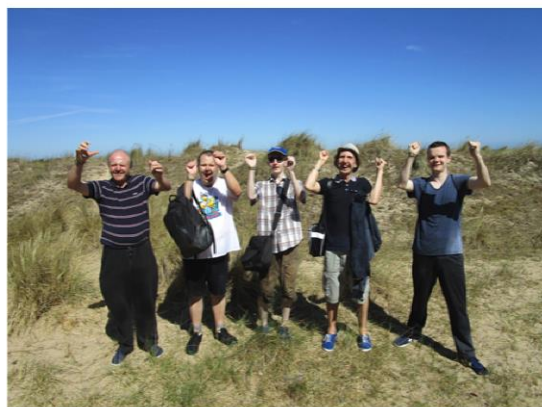
During the hot summer of 2018 a group of learners with autism had a memorable beach trip to Norfolk. This photo says it all.